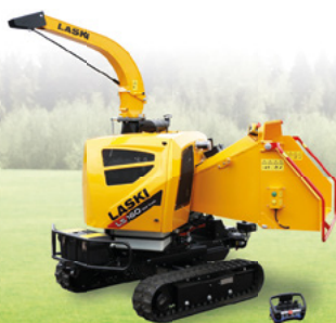
LS 160 DW Track