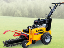
TR 60 HC