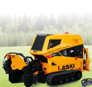
P 56 RX

The manufacturing plant is located in the Czech Republic and the Laski products are exported to 50 countries worldwide, such as Australia, Chile, India, the USA and in particular to the EU states. The company's export sales represent about 90% of its total output. At the same time the Laski products conform to all applicable environmental requirements, EU standards, regulations and directives.