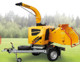
LS 160 DWB