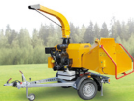
LS 160 PB

A powerful helper for municipal maintenance.