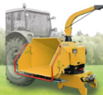
LS 160 TT