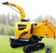
LS 160 DW Track