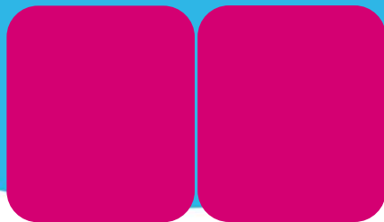
Double page spread 458 x 297 mm (+ 3 mm bleed) 89 000 CZK / 3 790 EUR