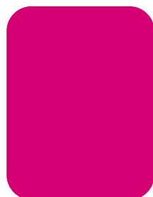
2nd cover page 229 x 297 mm (+ 3 mm bleed) 85 000 CZK / 3 650 EUR